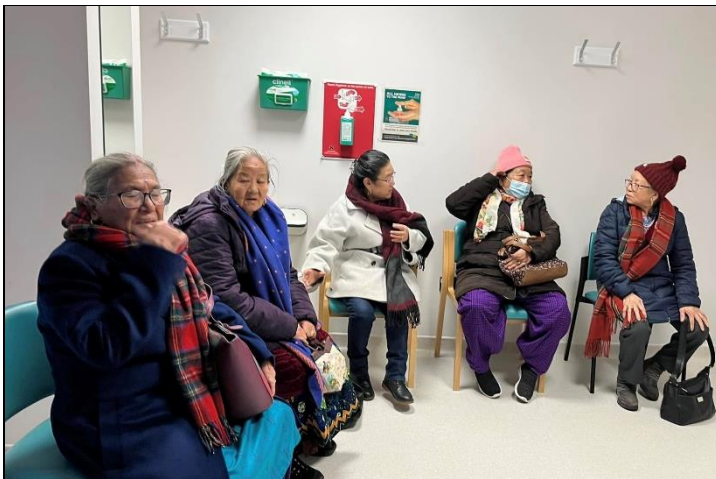
Lung Cancer screening- Bukland hospital, Dover