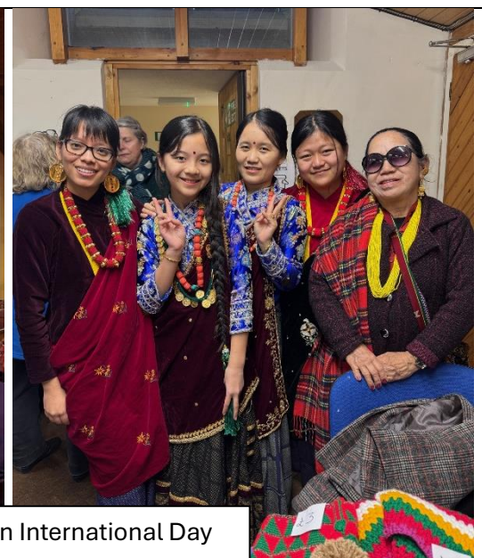
FNC Ladies at Women International Day