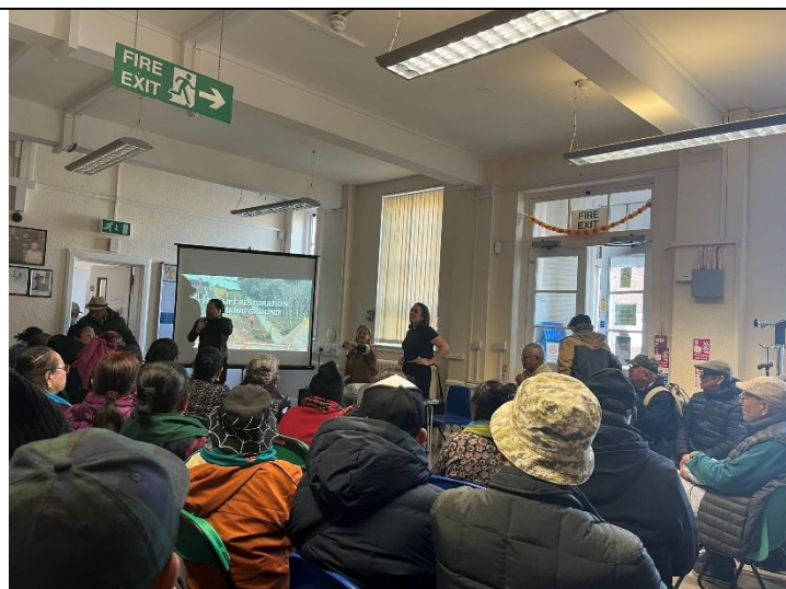
Leas Lift – Presentation