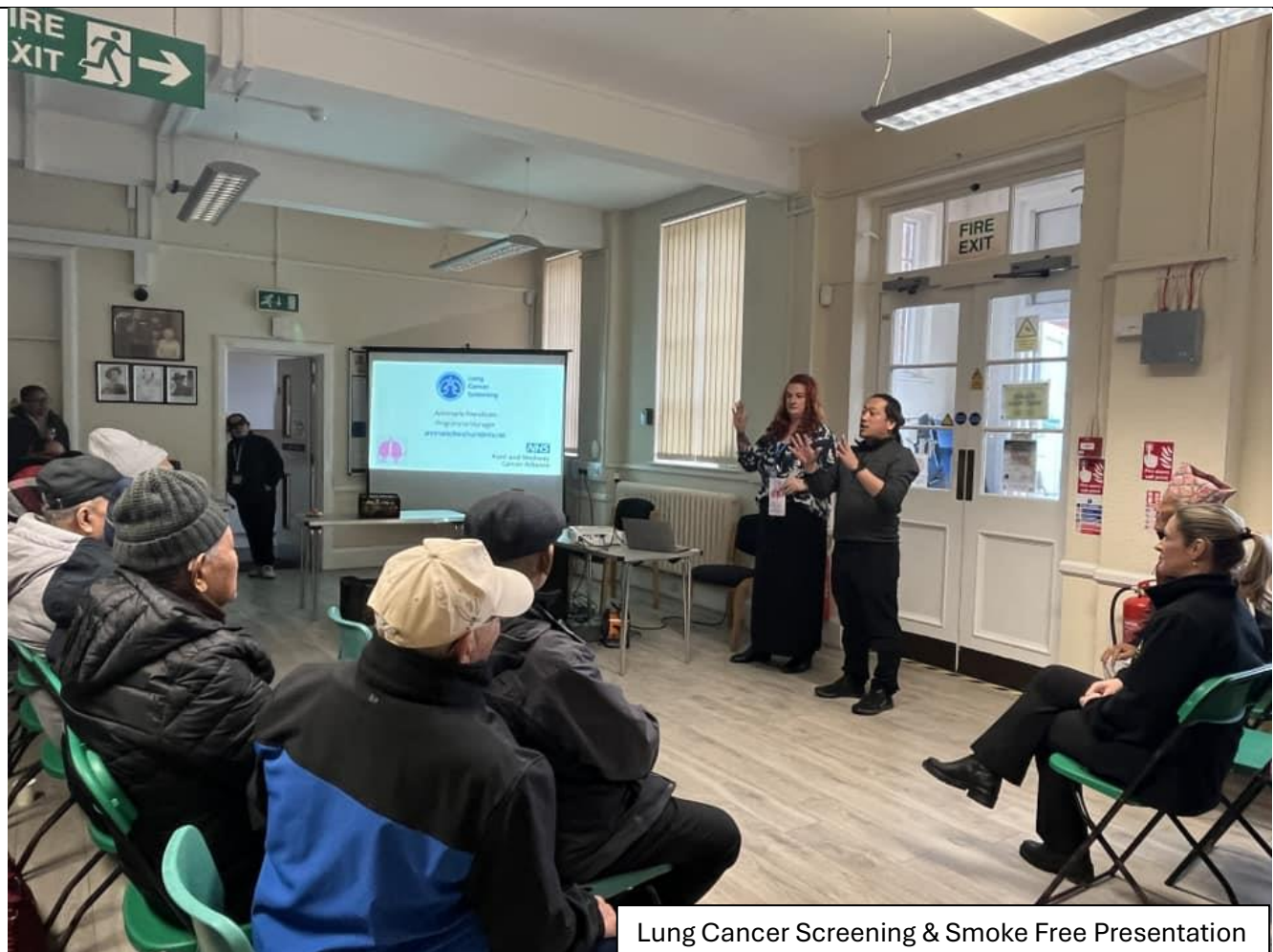
Lung Cancer Screening & Smoke Free Presentation