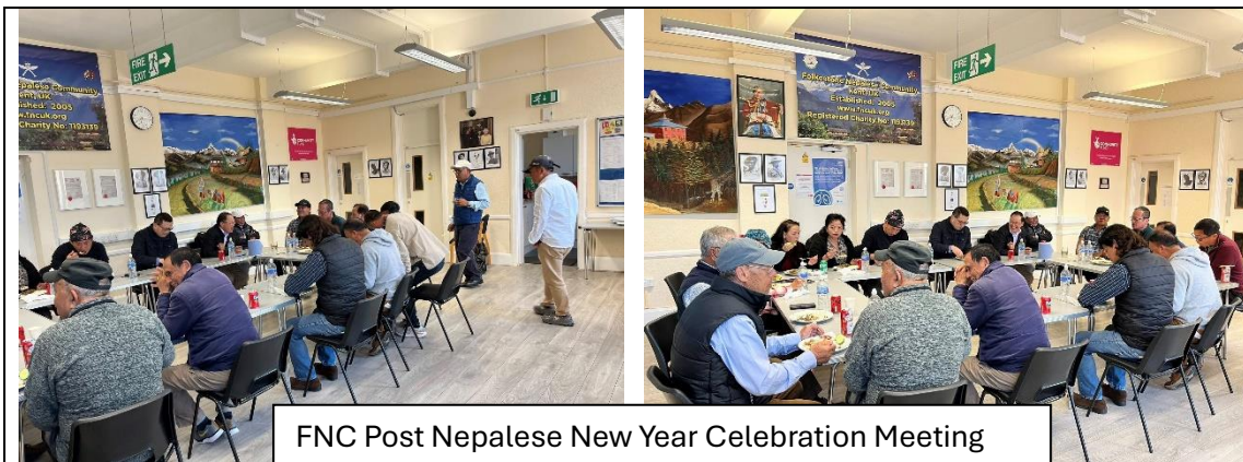
FNC Post Nepalese New Year Celebration Meeting