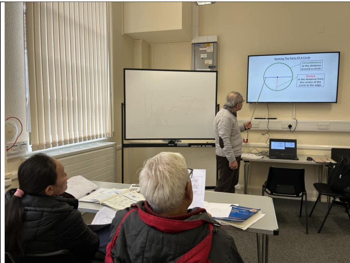
Math Entry Level 3 Class