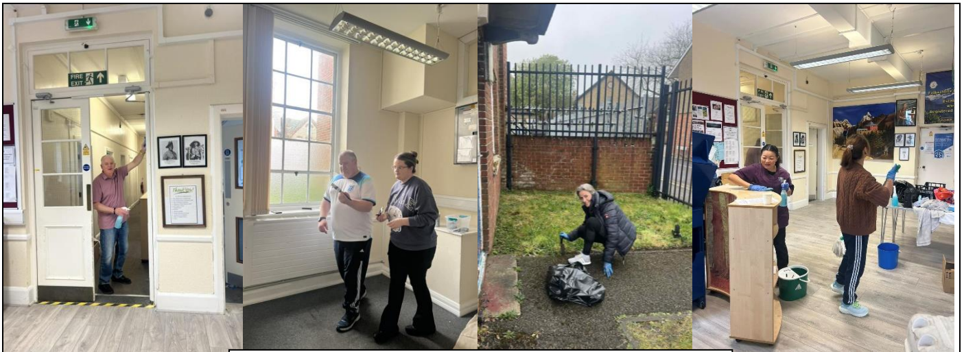
Aramark Volunteering - Deep Cleaning the FNC Centre