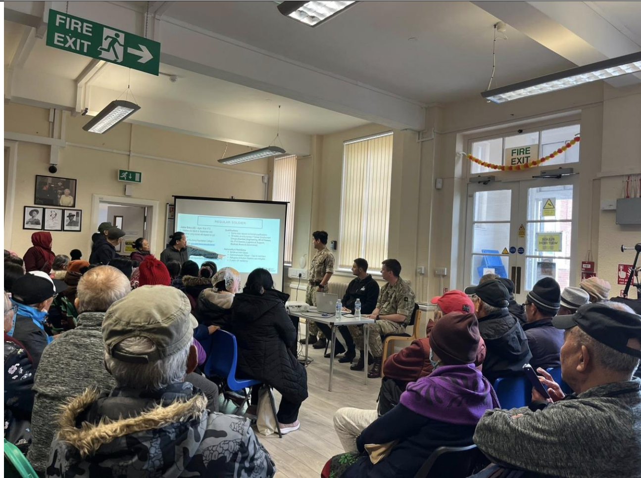
Armed Forces Careers Office Canterbury