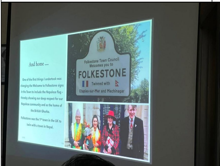
Presentation of Twining Town Hall between Nepal and UK