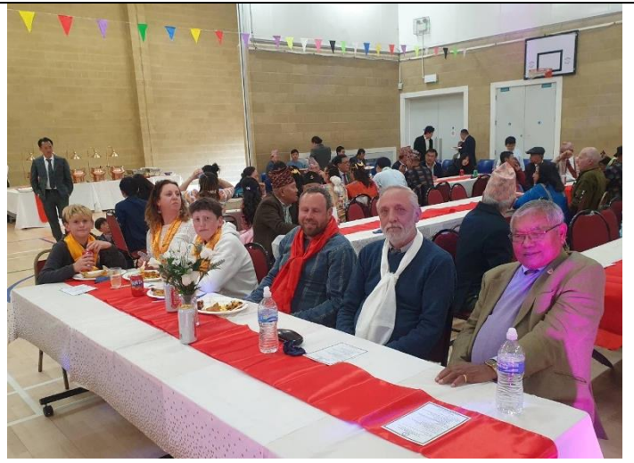
Charity Integration Evening Nepalese New Year