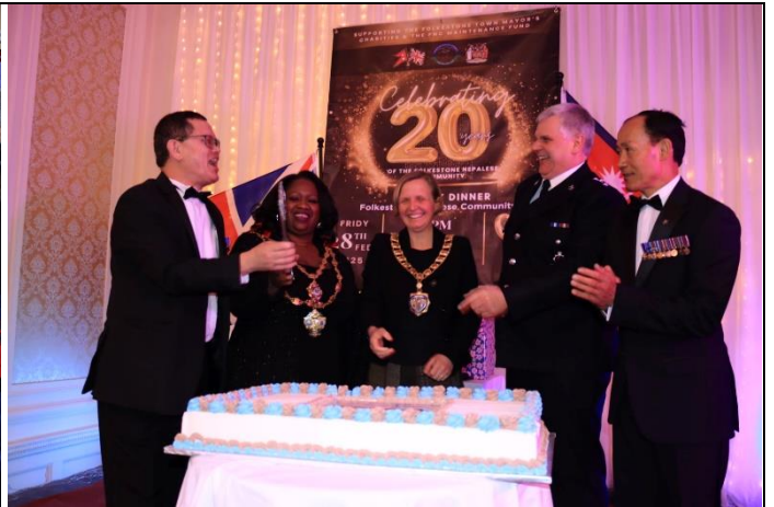
FNC Charity Dinner Night