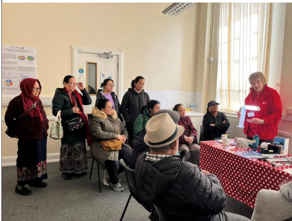
KAB's Mobile Sight Centre