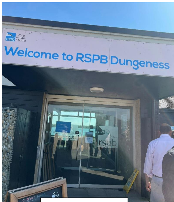
Visit to RSPB Dungeness