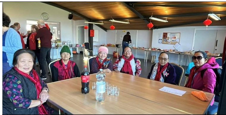
FNC Taichi students attended Chinese New Year