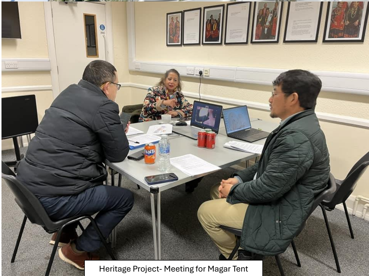
Heritage Project- Meeting for Magar Tent