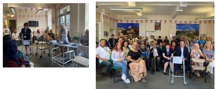
NHS Kent & Medway: Integrated Community Equipment and Wheelchair Services, presentation – 6 July 2023