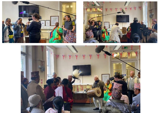
BBC2 Filming for the Andi Oliver Show by South Shore - 17 July 2023