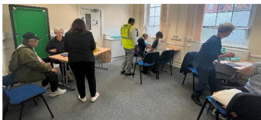
COVID 19 Autumn Booster at the Centre by Total Health Clinic PCNS – 28 Sep 2023