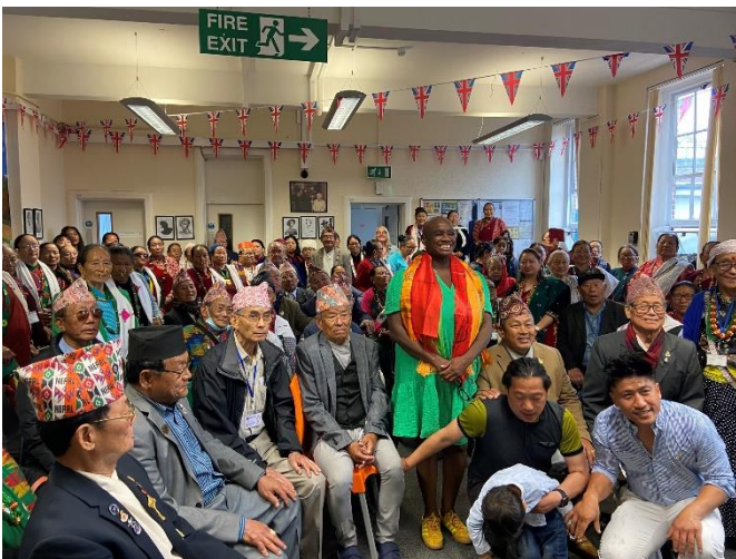
BBC2 Filming for the Andi Oliver Show by South Shore - 17 July 2023