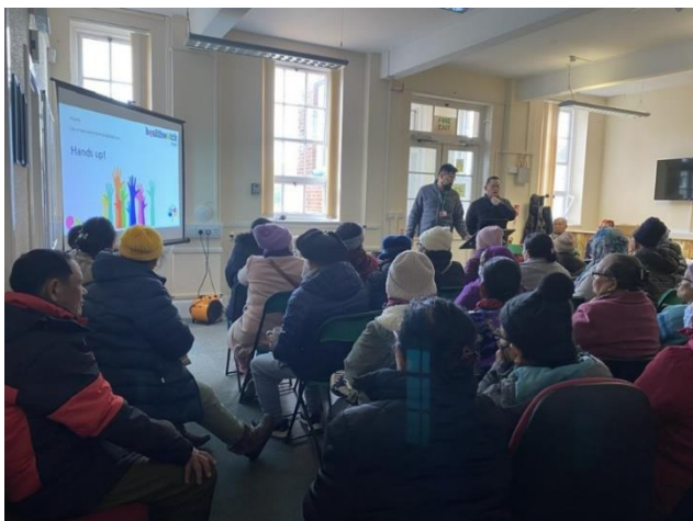
Healthwatch Kent – Listening Group with accessibilities equipment – 16 March 2023