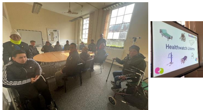
Healthwatch Kent – Listening Group with accessibilities equipment – 16 March 2023