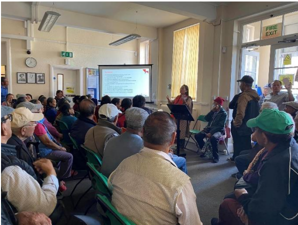
Banking System in Nepal for Gurkha Veterans – 12 August 2023