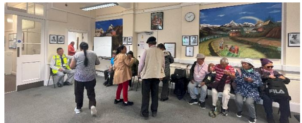
COVID 19 Autumn Booster at the Centre by Total Health Clinic PCNS – 28 Sep 2023