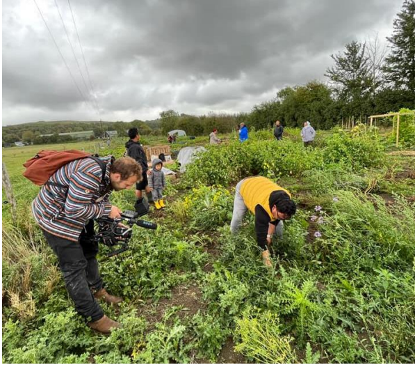
Channel 5 Filming Community Farm - 20 Sep 2023 by BriteSpark Films