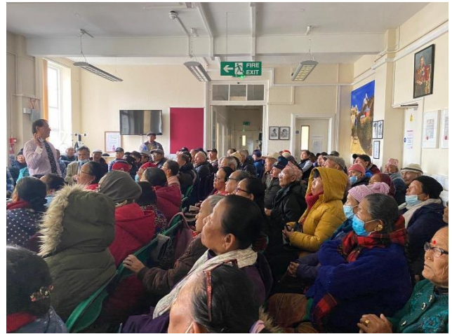
Gurkha Welfare Trust - Gurkha Veterans Welfare Advice - 19 Oct 2023