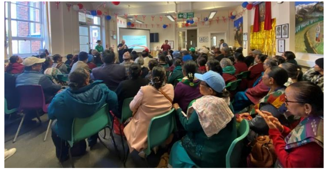
Presentation by Op Courage NHS Veterans Mental Health and Wellbeing Service – 08 June 2023