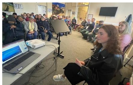
NHS Bowel Cancer Screening – East Kent Hospital University NHS Foundation Trust – 18 May 2023