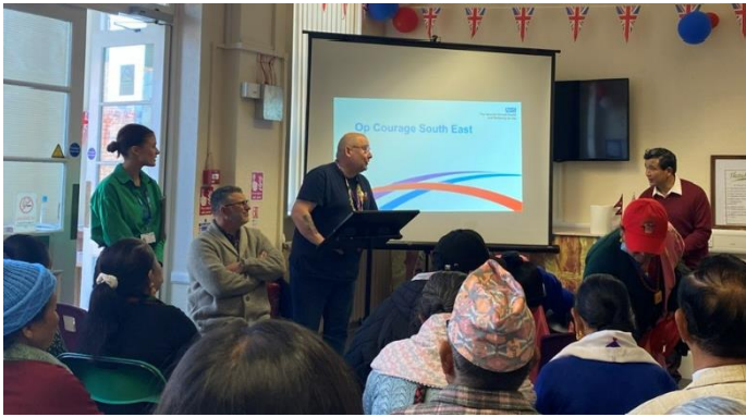
Presentation by Op Courage NHS Veterans Mental Health and Wellbeing Service – 08 June 2023