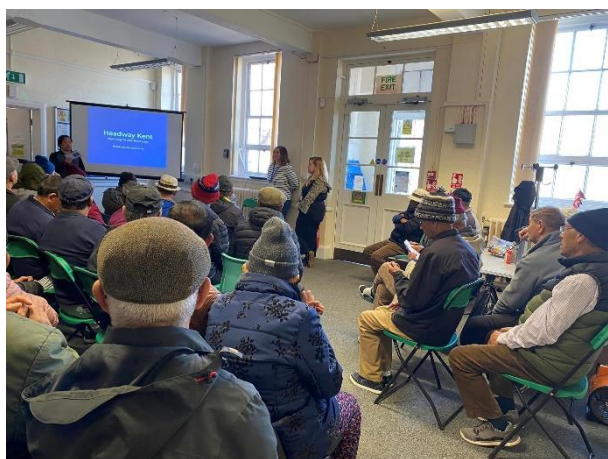
Headway Kent, Brain Injury Support – 02 May 2023