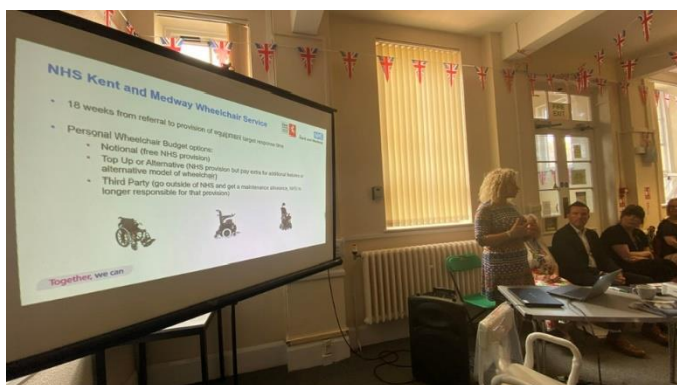
NHS Kent & Medway: Integrated Community Equipment and Wheelchair Services, presentation – 6 July 2023