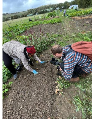
Channel 5 Filming Community Farm - 20 Sep 2023