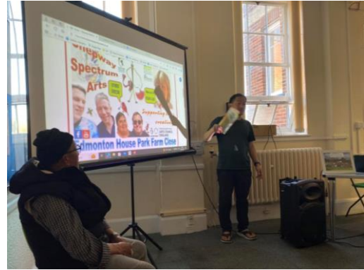
Retired Teacher now Cllr & Shepway Spectrum Arts - Presenting on SEND Education & Supports – 07 Sep 2023