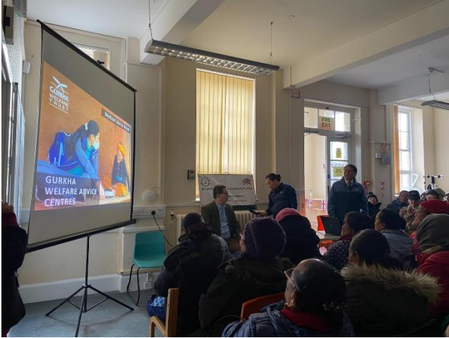
Gurkha Welfare Trust - Gurkha Veterans Welfare Advice - 19 Oct 2023