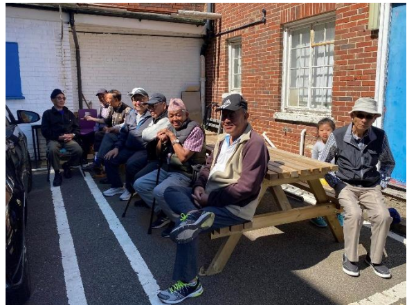
Banking System in Nepal for Gurkha Veterans – 12 August 2023