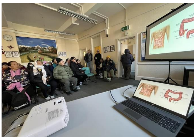
NHS Bowel Cancer Screening – East Kent Hospital University NHS Foundation Trust – 18 May 2023