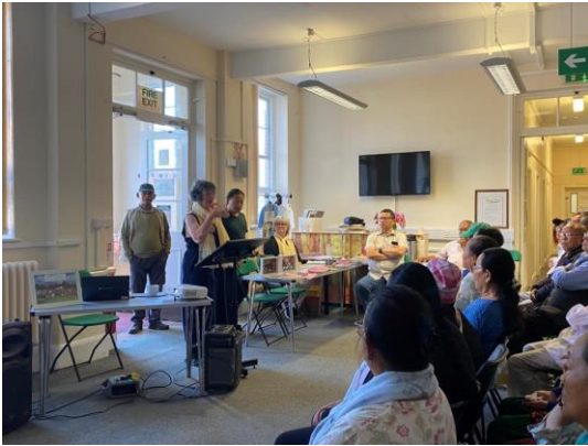
Retired Teacher now Cllr & Shepway Spectrum Arts - Presenting on SEND Education & Supports – 07 Sep 2023